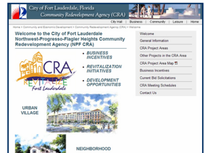
Old CRA Website